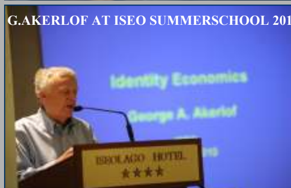
G.AKERLOF AT ISEO SUMMERSCHOOL 2010