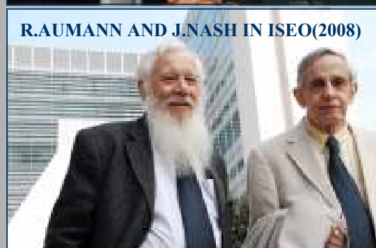
R.AUMANN AND J.NASH IN ISEO(2008)