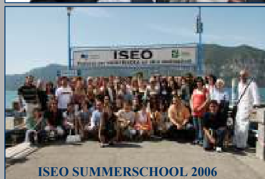
ISEO SUMMERSCHOOL 2006