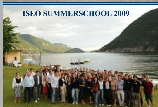
ISEO SUMMERSCHOOL 2009