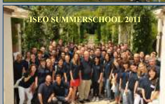
ISEO SUMMERSCHOOL 2011